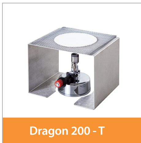
Dragon 200 - T