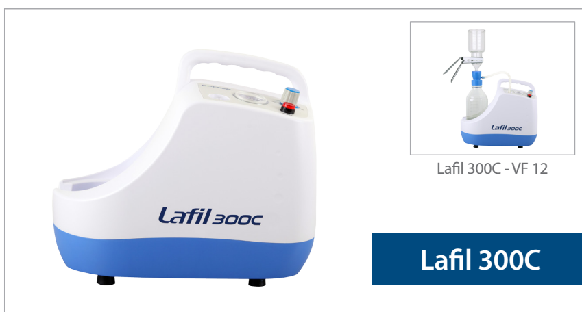
Lafil 300C - VF 12