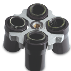
R-230 M + R-231 M (4 X 200 ml)