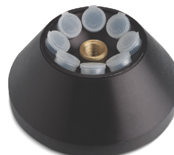
R-247 M (8 x 50 ml)