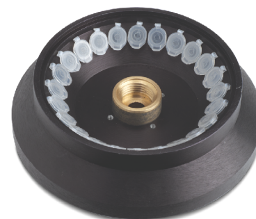
R-248 M (24 x 1.5ml)