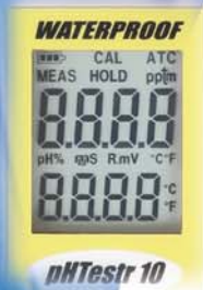
Large LCD Display