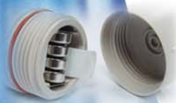
Twist-off Battery Compartment